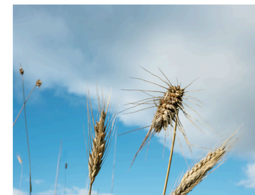
Trial plots at Gothelney Farm, Somerset, photographed by Lúa Ribeira.