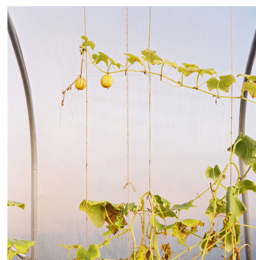
Polytunnel at Lauriston Farm in Edinburgh